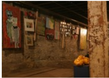
Dirt floors and brick walls add to the ambience of the basement of Gomez Art Supply, 1028 O St.

With this in-your-face style of art, it may be difficult to bring in that different clientele, she said.